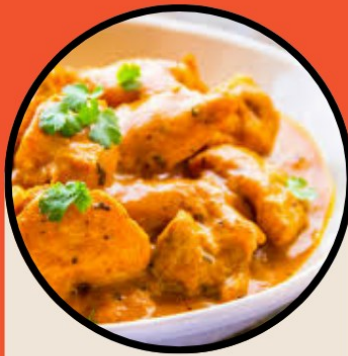
Butter Chicken with Steamed rice