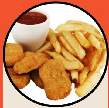
Chicken Nuggets and Chips