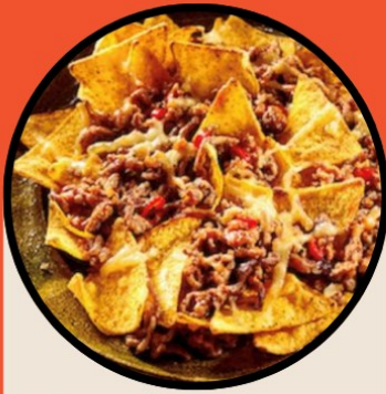
Nachos with Beef Salsa